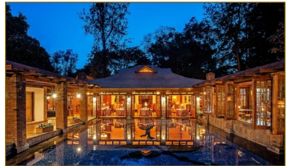
Overnight Elewana Arusha Coffee Lodge

Flight arrivals can be anytime on this day allowing you flexibility with time to rest and recover before our adventure begins. Most international flights arrive in the evening. The remainder of the day and dinner is at leisure.