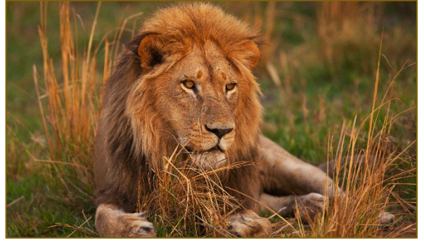
Overnight Elewana Serengeti Explorer (B,L,D)

This evening, we gather for a festive Farwell Dinner at the lodge and relax with after-dinner drinks in the Agama Terrace Bar.